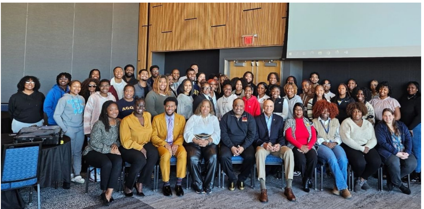
JOMC students, faculty, and staff at the Roland Martin masterclass.