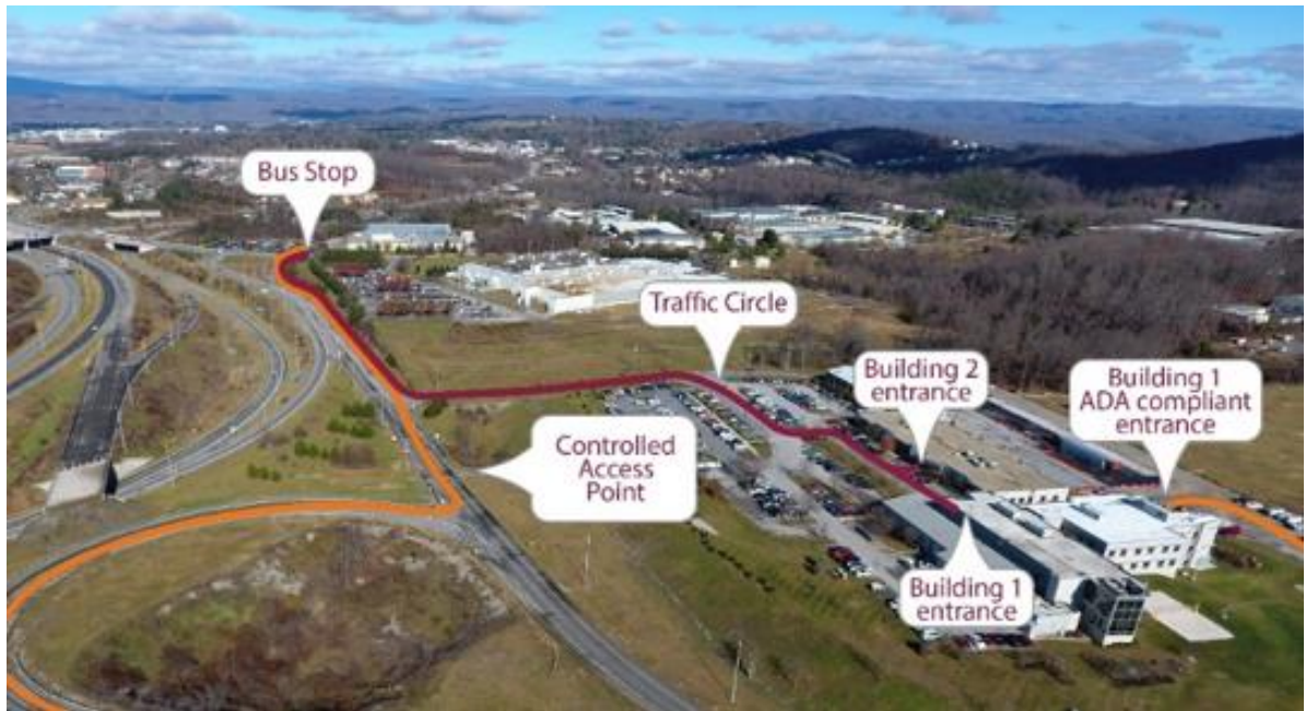
Figure 3. An aerial photo of the VTTI campus showing the LSAV route extending from the entrance to VTTI Building 2 to the Blacksburg Transit bus stop (maroon line).