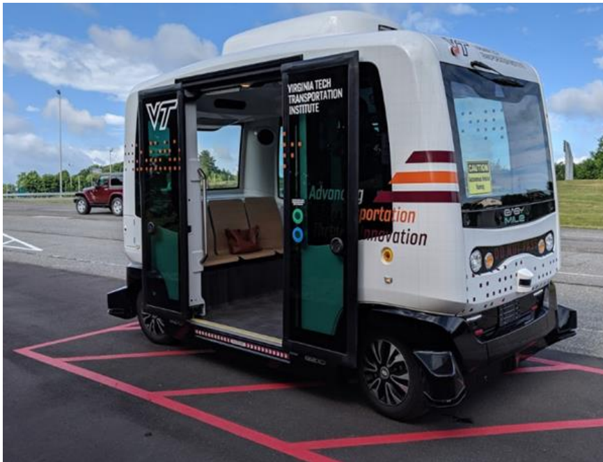
Figure 2. A photograph of the VTTI EasyMile LSAV that was implemented for this project. Although much time and effort were spent achieving this task, human participant testing in-person with the vehicle, or otherwise, was forestalled by the occurrence of the COVID-19 pandemic. Revised university experimental protocols that protected human participants were implemented and maintained throughout the data collection phase of work. The research team developed an alternative approach that used multimedia, electronic surveys, and remote online meeting tools to complete the project.

The original study plan included prerequisite implementation of an LSAV in a real-world operating environment at VTTI so that study participants would have a very realistic experience with respect to their use of the vehicle. Figure 2 and Figure 3 show the LSAV that was acquired for this study and the route over which that it was operated between VTTI and a nearby Blacksburg Transit bus stop. A second Center for Advanced Transportation Mobility project report documenting these activities is planned as an accompanying report to this document.